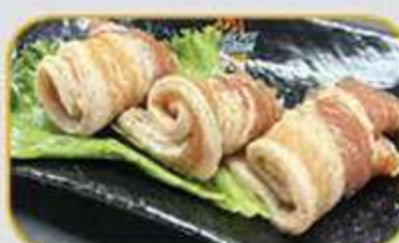
Miso Pork Belly *