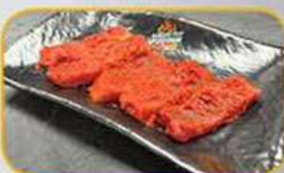
Spicy Tuna * (Dinner)