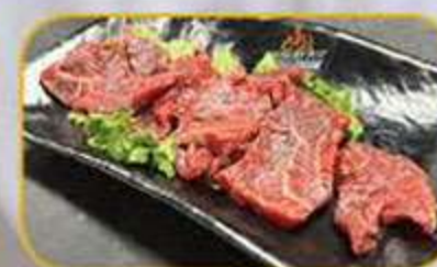
Angus Chuck Flap Tail * (Dinner)