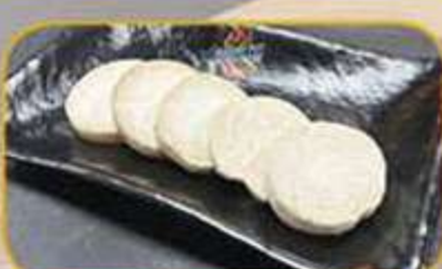
King Oyster Mushroom