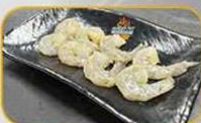
Garlic Shrimp * (Dinner)