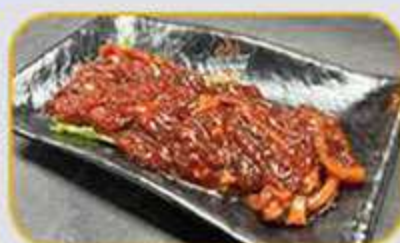
Spicy Beef Bulgogi *