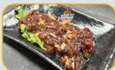
Beef Bulgogi *