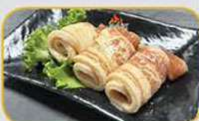
Smoke Garlic Pork Belly *