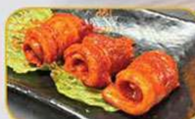
Spicy Pork Belly *