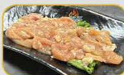
Chicken Bulgogi *