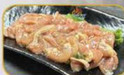
Garlic Chicken *