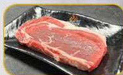
Ribeye Steak * (Dinner)