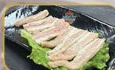
Signature Pork Cheek * (Dinner)