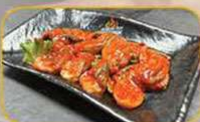
Spicy Baby Octopus * (Dinner)