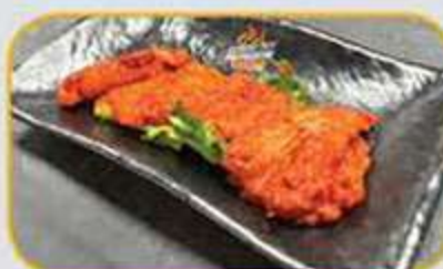
Spicy Fish Fillet *