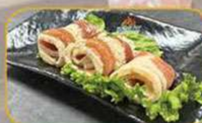
Hungry Pot Pork Belly *