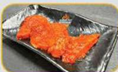
Spicy Salmon * (Dinner)