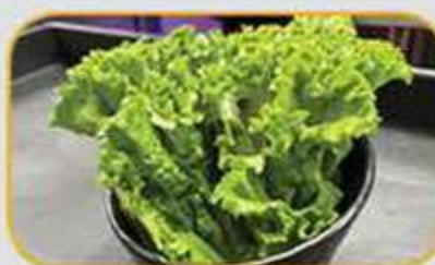
Green Leaf Lettuce