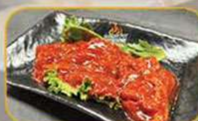
Spicy Pork Bulgogi *