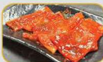
Spicy Calamari *