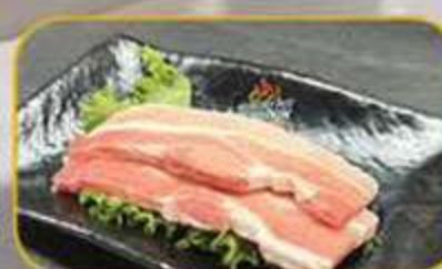
Pork Belly *