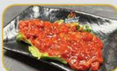
Spicy Chicken Bulgogi *