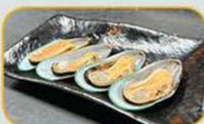
Mussel * (Dinner)