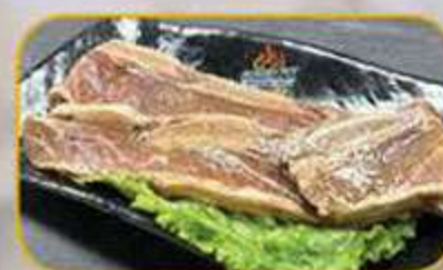
Hungry Short Rib * (Dinner)